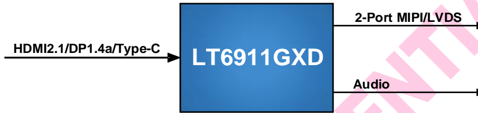
Figure 3.1 Application Diagram