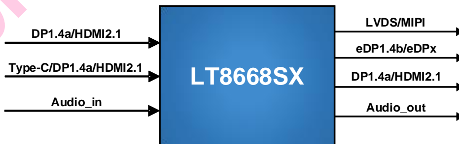
Figure 3.1 Application Diagram