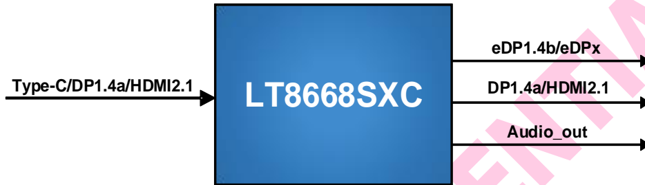
Figure 3.1 Application Diagram