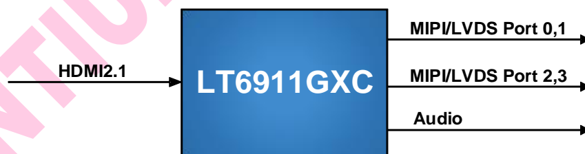
Figure 3.1 Application Diagram