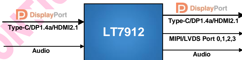
Figure 3.1 Application Diagram