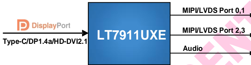
Figure 3.1 Application Diagram