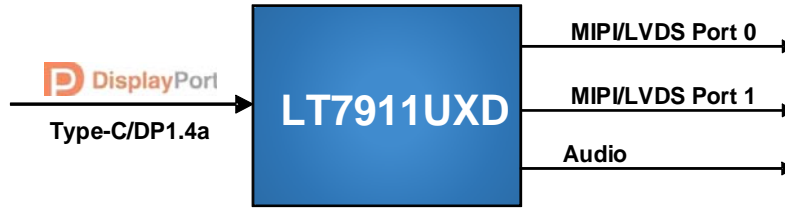
Figure 3.1 Application Diagram