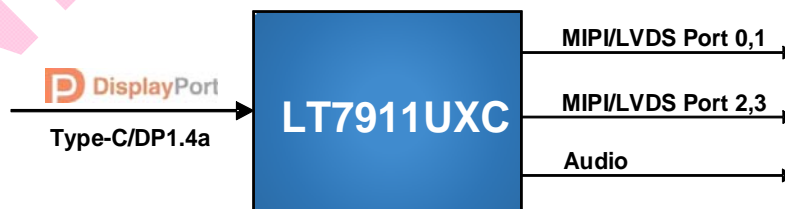
Figure 3.1 Application Diagram