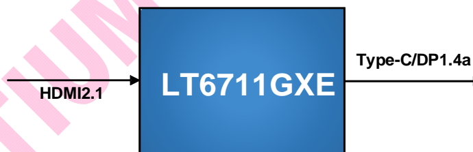
Figure 3.1 Application Diagram