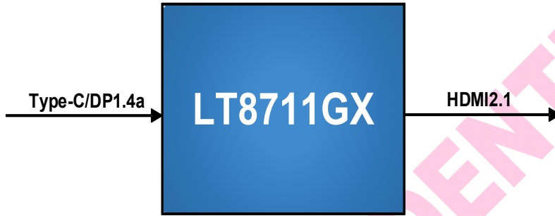
Figure 3.1 Application Diagram