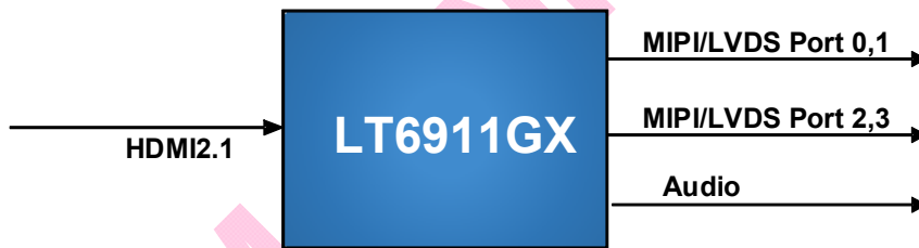
Figure 3.1 Application Diagram