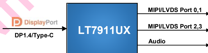
Figure 3.1 Application Diagram