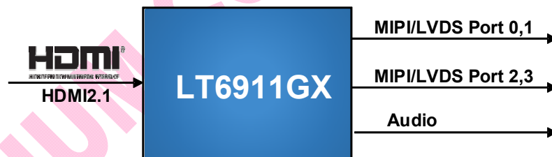
Figure 3.1 Application Diagram