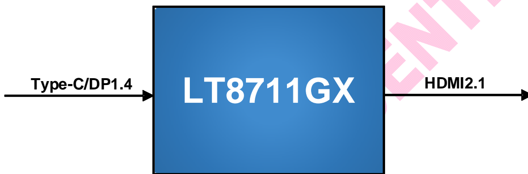
Figure 3.1 Application Diagram