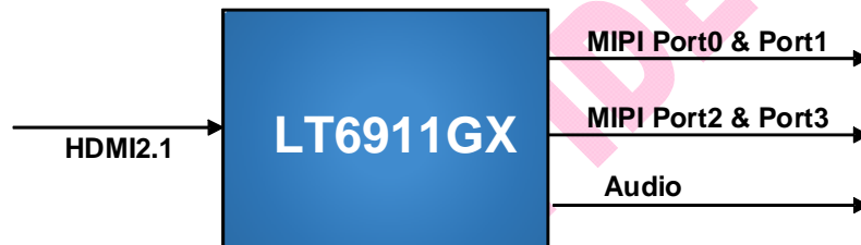
Figure 3.1 Application Diagram